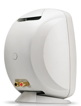
Mounting brackets & bookshelf feet are included in box